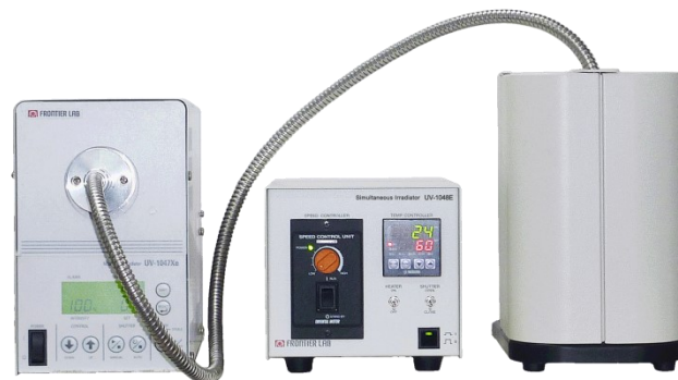
UV light source * (UV-1047Xe with Xe lamp)

Using UV/Py-GC/MS system, the irradiated polymer samples can be analyzed by EGA (Evolved Gas Analysis) or Py-GC/MS analysis.