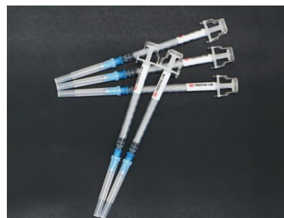
Micro Sample Collectors

The micro coil is disposable, but depending on analytical purposes it can be reused by cleaning with a solvent.