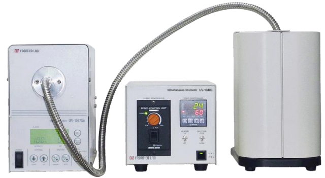
UV light source * (UV-1047Xe with Xe lamp)

Using UV/Py-GC/MS system, the irradiated polymer samples can be analyzed by EGA (Evolved Gas Analysis) or Py-GC/MS analysis.